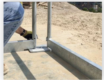
Step 4: Pin guardrail and repeat.