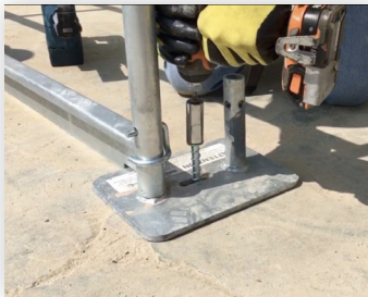
Step 1: Install the baseplate.

The HSRS installation is a rapid 4-step process. 200 linear feet of OSHA compliant guardrail can be installed in concrete substrates in less than one hour with a single anchor bolt, or on a wide variety of other surfaces using our non-penetrating weighted bases.