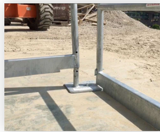
Step 3: Set guardrail section on baseplate.